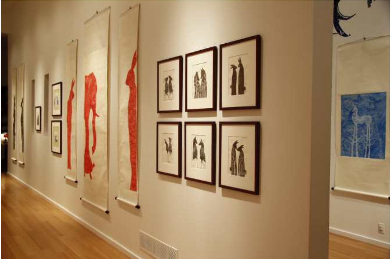
Headbones Gallery - 2015