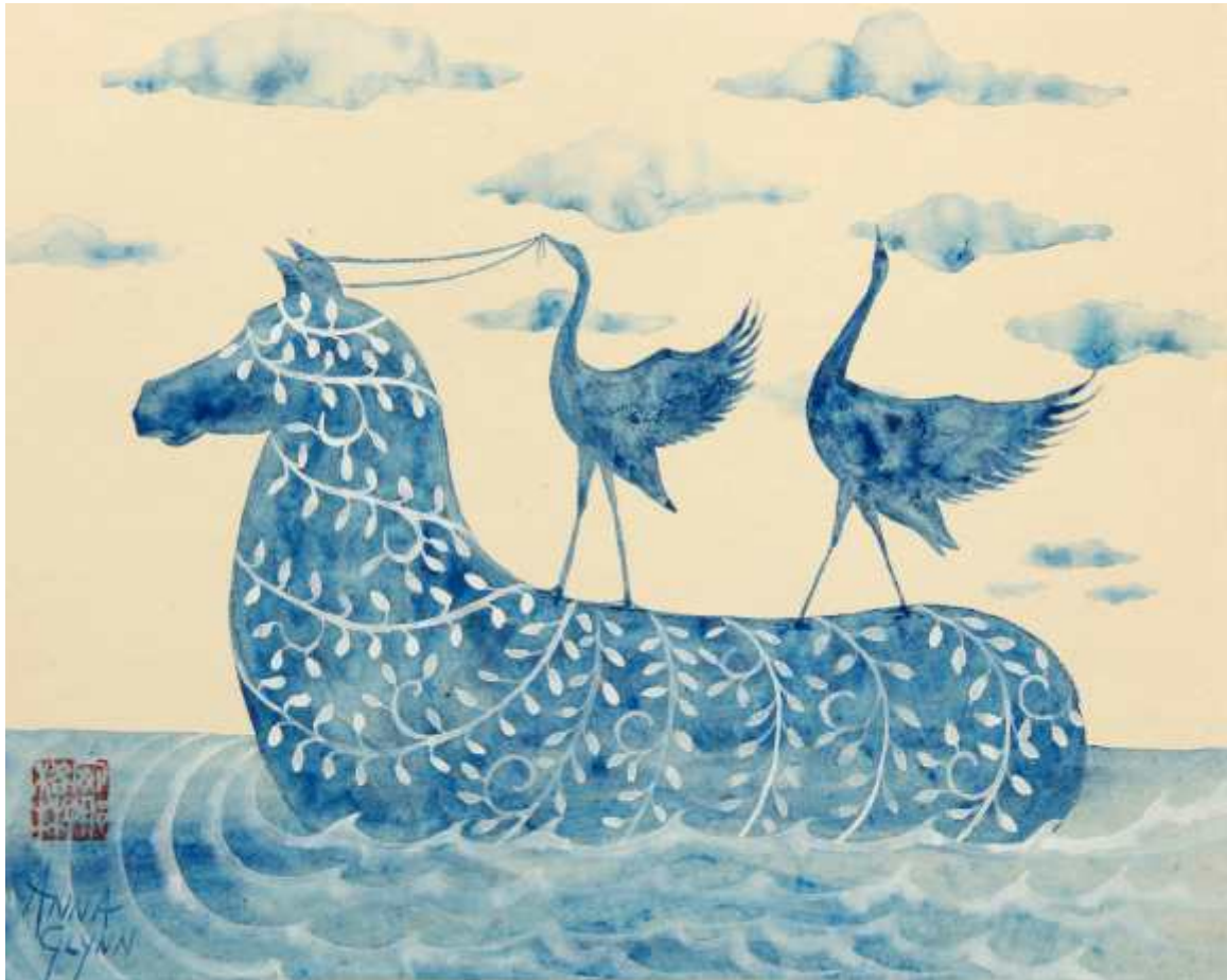
Blue Bird Sailing Duo - 2014, Chinese Ink on treated xuan paper, 11.4" x 9", 29cm x 23cm