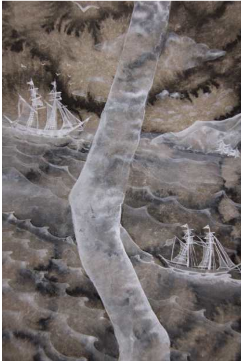
RABBIT GUARDIAN I - 2013

Scroll: Chinese Ink on treated xuan paper, 18.1" x 67.3", 46cm x 171cm (with detail)