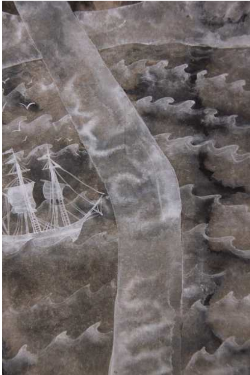
RABBIT GUARDIAN I - 2013

Scroll: Chinese Ink on treated xuan paper, 18.1" x 67.3", 46cm x 171cm (with detail)