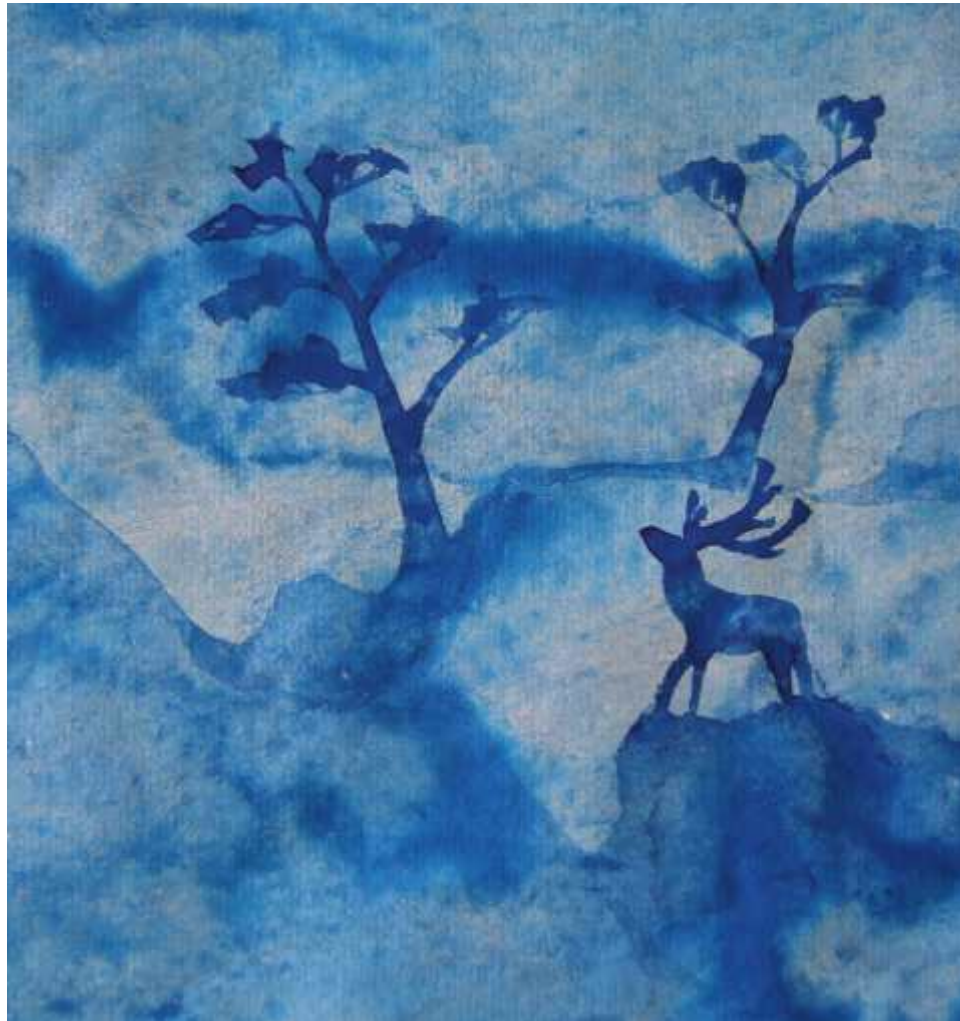
BLUE HORSE DREAMING - 2014 Chinese Ink on treated xuan paper, 25.6" x 33", 65cm x 84cm (with detail)